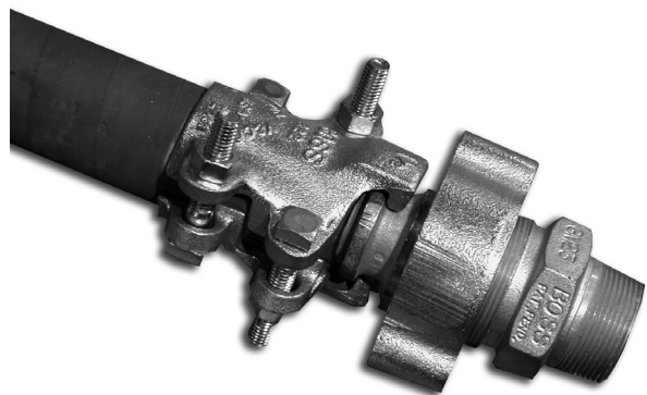
HI-Temp Steam Rated Hose and Quick Connectors