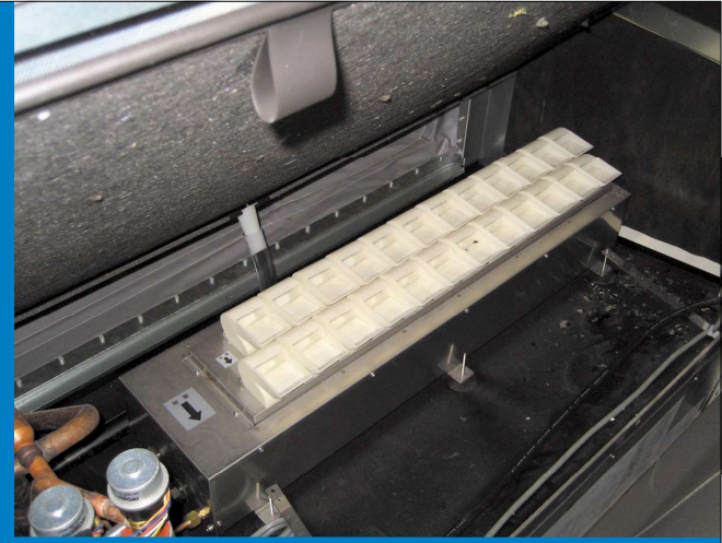
FT-P242UV in all-in-one A/C system

Standard Dimensions(mm) Drawings for Transformer Box and CE Compliance, please contact us.