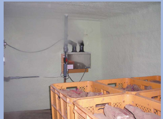
Sweet potato storage